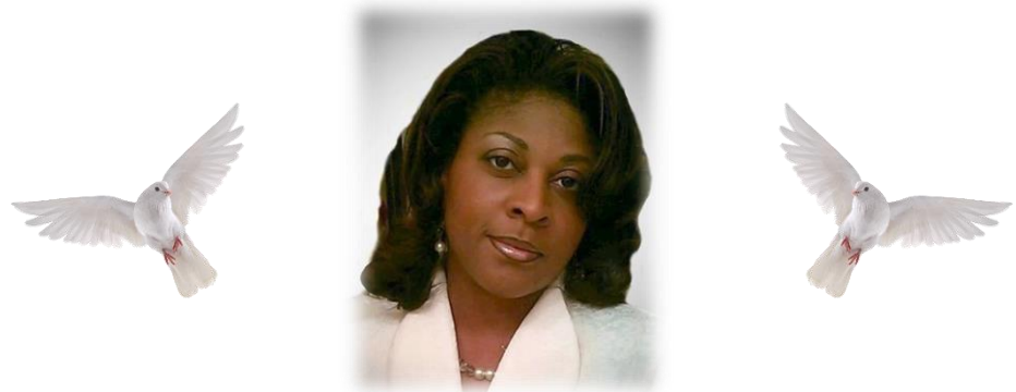
Beloved Board Member Since 2021